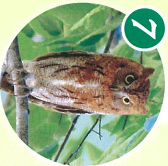
These owi are colled Sekishoku konohazuku