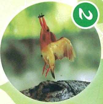
Akashobin emptying the shell of egg from the nest