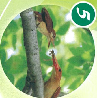
Akashobin feeding chicks