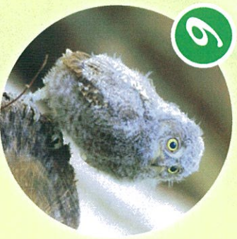
Sekishoku konohazuku's chicks